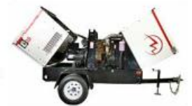
Magnum MMG55FH Flip Hood 52 kW Mobile Diesel Generator