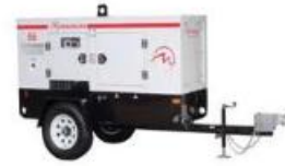
Magnum MMG55 49 kW Mobile Diesel Generator