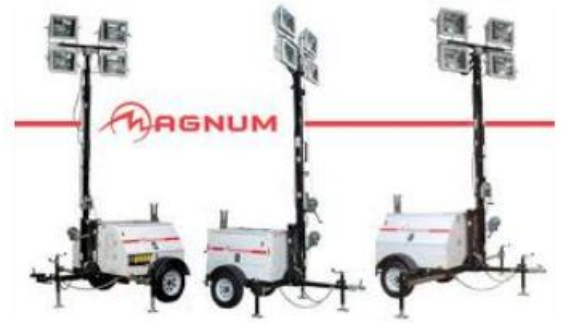
Magnum Family of Light Towers