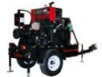
MTP 4000D Dry Prime Pump